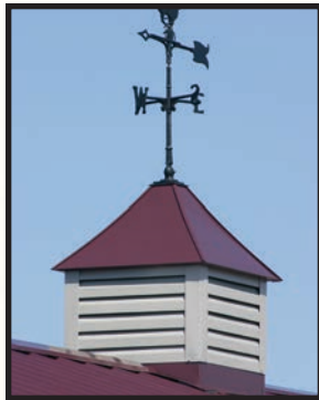
Cupolas Available in 24", 36" and 48"