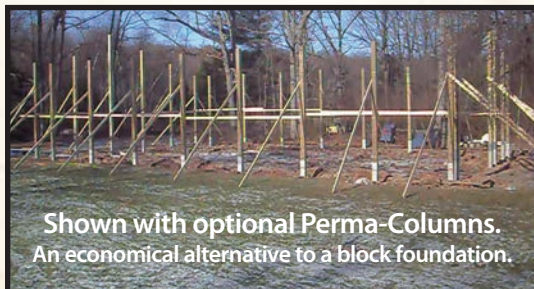
Shown with optional Perma-Columns. An economical alternative to a block foundation.