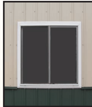
Standard 36"x36" Insulated Sliding Window