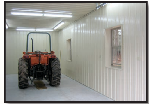
Metal Finished Interior