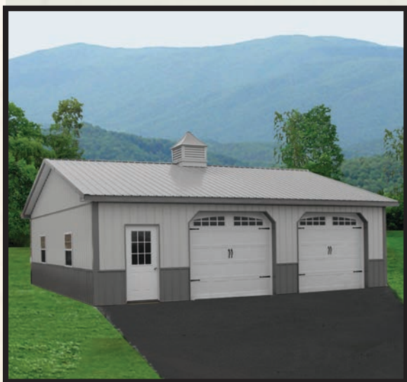
P-112 – Cover Photo