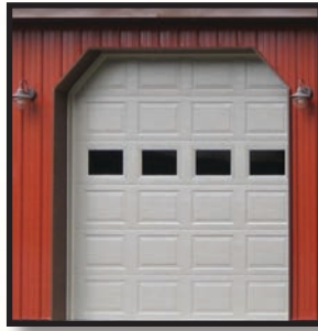
All Size Doors Available