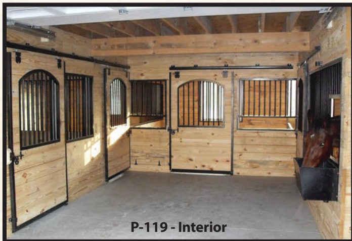
P-119 - Interior