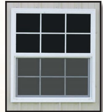
36x40 Residential-Style Window